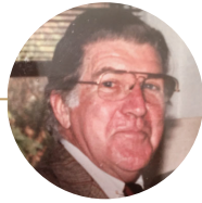
ART HILL NEW CANAAN FIELD CLUB