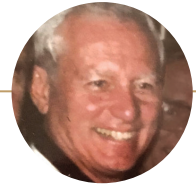
TAD BOWEN SHORE & COUNTRY CLUB