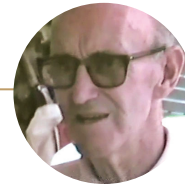
JACK GILLESPIE LAKE CLUB